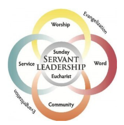
A Parish of the Roman Catholic DIOCESE OF SCRANTON