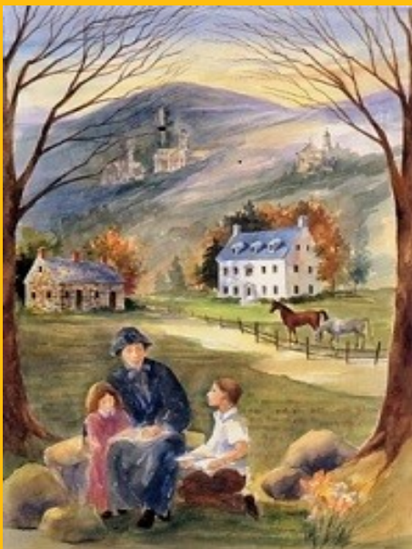
SAINT ELIZABETH ANN SETON, PRAY FOR US!

32nd Sunday Ordinary Time (Cycle B) 1 Kings 17:10-16 Psalm 146:7-10 Hebrews 9:24-28 Mark 12:28-24