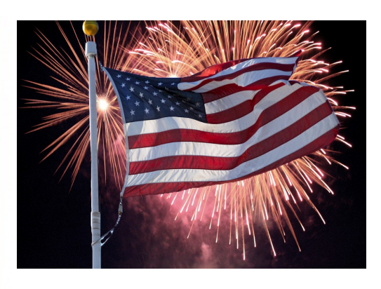
Have a Happy and Safe 4th!!! Mass will be held Thursday Morning at 9:00 . The parish office will be closed in observance of the holiday.