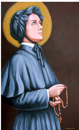
St. Elizabeth Ann Seton, pray for us!

Bulletin deadline: Friday, one week prior to the publication week.