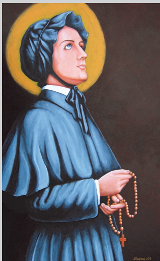
St. Elizabeth Ann Seton, pray for us!

Bulletin deadline: Friday, one week prior to the publication week.